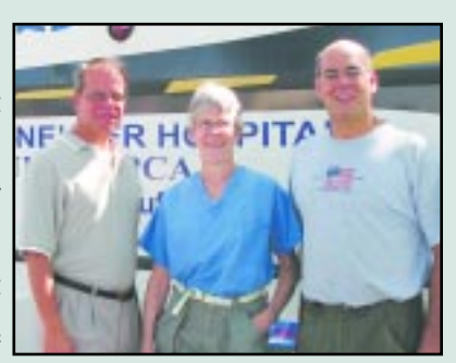
Farmingdale-TNR Program, 361 Main Street, Farmingdale, NY 11735 Attn: Deputy Mayor Joe Rachiele Rachiele Rachiele Rachiele Rachiele Rachiele Rachiele Rachiele Rachiele Rachiele Rachiele Rachiele

unteers: 19 male cats were neutered, 6 females spayed and three kittens rescued. 3 new cat colonies where also identified within the Farmingdale area. Over $350 was also raised from donations For more information you can visit www.licp.org. Donations can be sent to Village of Rachiele.