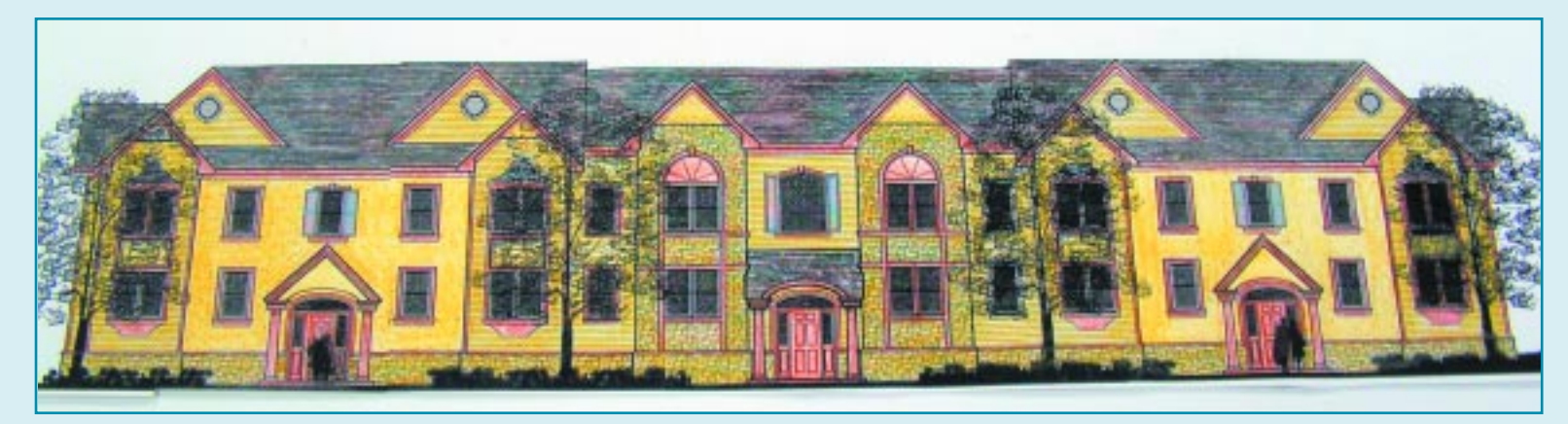
Artist rendering- final colors may change.

The Sale of 150 Secatogue Avenue to Fairfield Properties has been completed. Fairfield Properties has a rock solid, 30 year reputation of providing superior care and service for all its properties. They maintain immaculate grounds and utilize innovative programs to match the needs of each community. The renovation plans have been approved and the work has already begun. The apartments, as the leases come up, are being completely gutted, updated and modernized. The building will also receive structural steel reinforcement over next few weeks. As the above illustration shows, the new façade will be comprised of brick, stucco and hardy board. The grounds will be completely landscaped with a gazebo in the front courtyard.